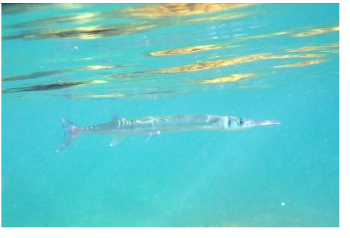
Houndfish. Tylosurus crocodilus. M-L. 1-3. Si & Sh,