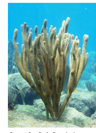
Porous Sea Rod. Pseudoplexaura spp. M-L, 5-7