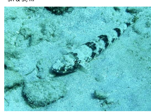
Sand Diver. Synodus intermedius. S-M. 2 & 3. Si, Sa