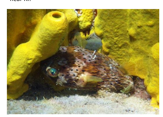
Ballonfish. Diodon holocanthus. S-M. 3-5. Si, Sg, Rf, H. Note iridescent specs in the eyes