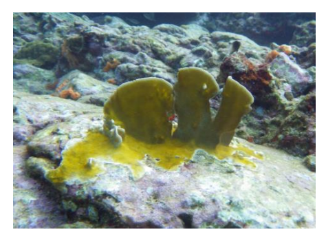
Blade Fire Coral. Millepora complanata . S-M, 1-3 and 5-