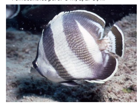
Banded Butterflyfish. Chaetodon striatus. S. 1-3 & 5-7. Si, Rf. Frequently in pairs