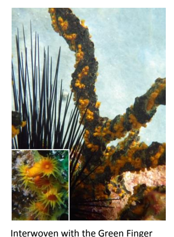
Sponge is the Golden Zoanthid. Parazoanthus swifti. VS, 3.