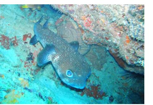
Porcupinefish. Diodon hystrix. M-L. 1. Si, Rf, H. Prefers caves and overhangs