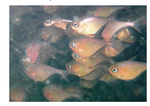
Glassy Sweeper. Pemphris schomburgki. S. 1 & 2 in caves. Sh, Rf