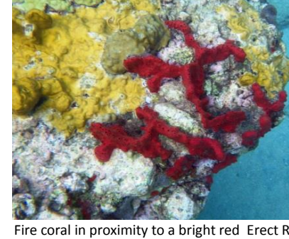
Fire coral in proximity to a bright red Erect Rope Sponge. ?Amphimedon compressa. S-M, 3.