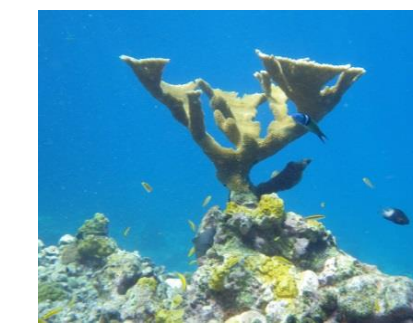
Elkhorn Coral. Acropora palmata. M-L, 1-2