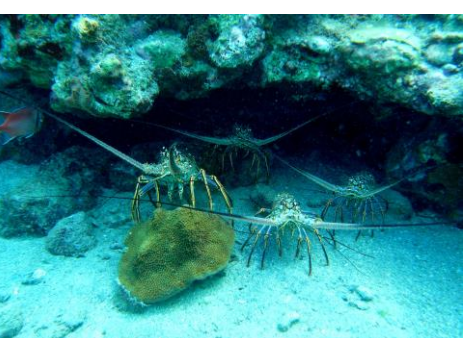
Caribbean Spiny Lobster. Palinurus argus. S-M. 2. 3. Hides in caves and recesses.