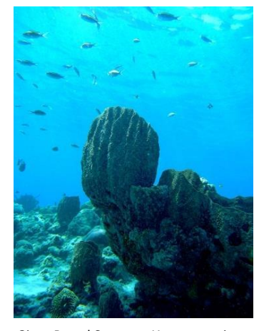
Giant Barrel Sponge. Xestospongia muta . L-VL, 1-3 and 7