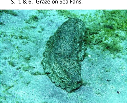
Furry Sea Cucumber. Astichopus multifidus. S-M. 2-4.

Social Feather Duster. Bispira brunnea. S. 3.