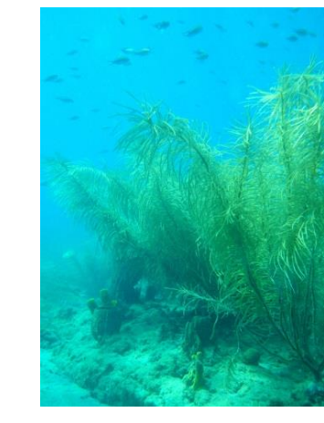
Sea Plumes. Pseudopterogorgonia spp. L-VL, 6 and 7.