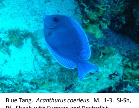
Rf. Shoals with Surgeon and Doctorfish.