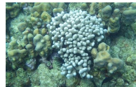
Branched Finger Coral Porites furcata . S-M, 1-2. Surrounded by Star Coral Monastraea sp.

Coral and coral like species. Included within this group are stony corals, soft corals, fire corals and sponges