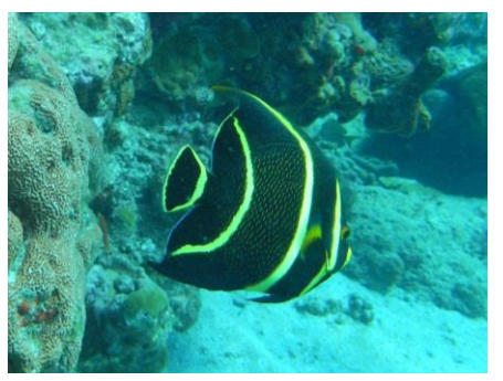
French Angelfish (juvenile form). Pomacanthus paru. S-M, 1, 2. Si, Rf