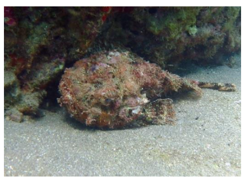
Well camouflaged Spotted Scorpionfish. Scorpaena plumieri. S-M. 2 &3, 5-7. Si, Sa, Rf. 😕