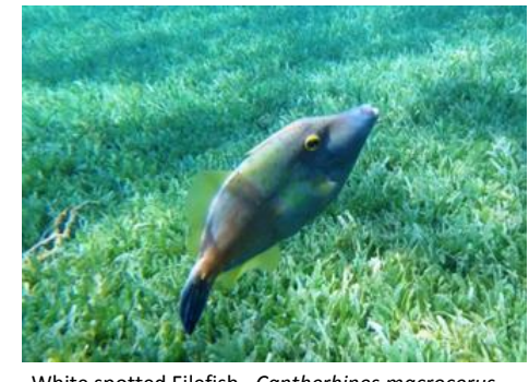
White spotted Filefish. Cantherhines macrocerus. S-M. 3,4. Si, Sg, Rf.