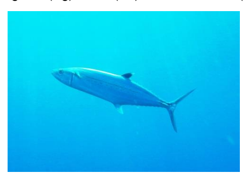
Cero. Scomberomorus regalis. M-L. 1. Si, Ow

Yellowfin Mojarra. Gerres cinereus. S-M. 3-5. Si,