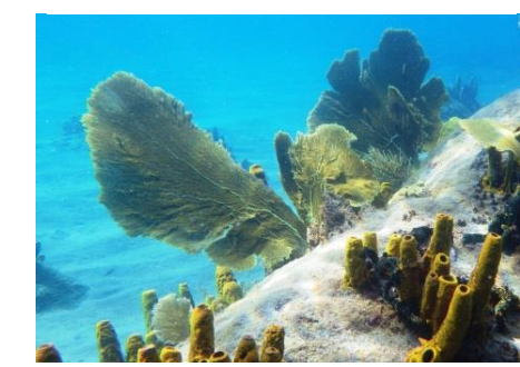
Venus Sea Fan. Gorgonia flabellum . M-L, 1 and 5-7.