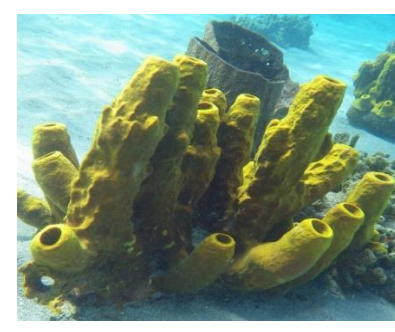
Yellow Tube Sponge. Aplysina fistularis . M-L, 1-3 and 5-7