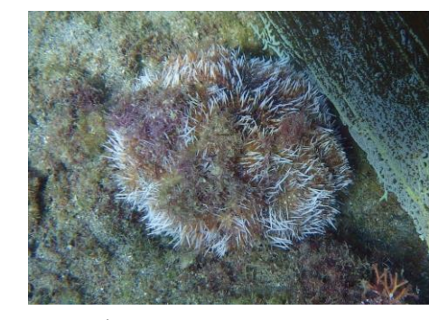
West Indian Sea Egg. Tripneustes ventricosus. S, 3 & 5-7. Camouflaged with algae