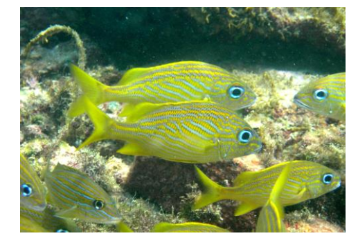
French Grunt. Haemulon flavolineatum. M. 2, 3, 6, 7. Sh, Rf.