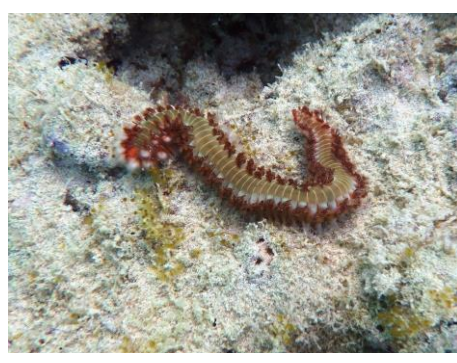
Bearded Fireworm. Hermidoce carunculata. S. 3,5&6 🙁