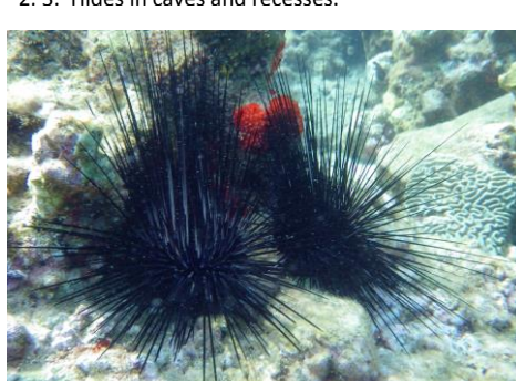
Long-spinned Urchin. Diadema antillarum. S. 2.

Social Feather Duster. Bispira brunnea. S. 3.