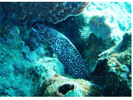
Spotted Moray. Gymnothorax moringa. S-L. 1 & 2. Si, Rf. H.