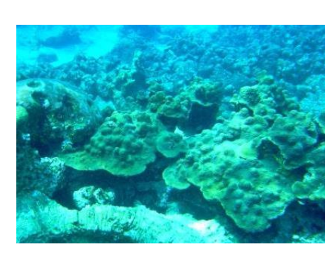
Mountainous Star Coral. Montastraea faveolata. L, 1