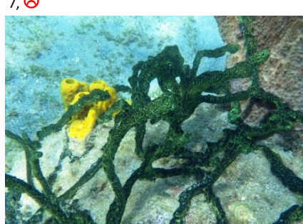
Green Finger Sponge. Iotrochota birotulata. M, 3.