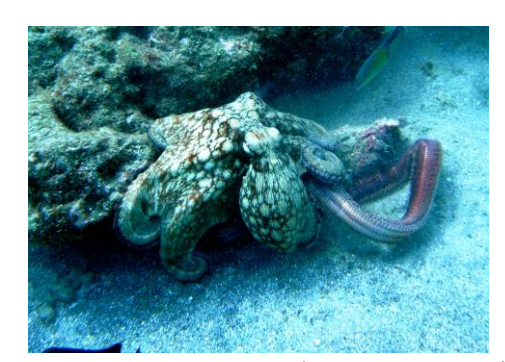
Common Octopus. Octopus vulgaris. S-M. 3. Pictured attacking a giant worm Eunice aphroditois.