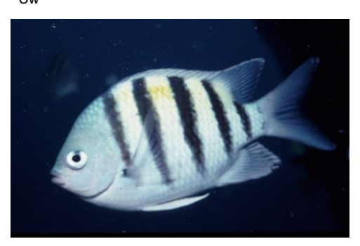
Seargeant Major. Abudefduf saxatilis. S. 2,3 & 5-7. Sh & Si, Rf