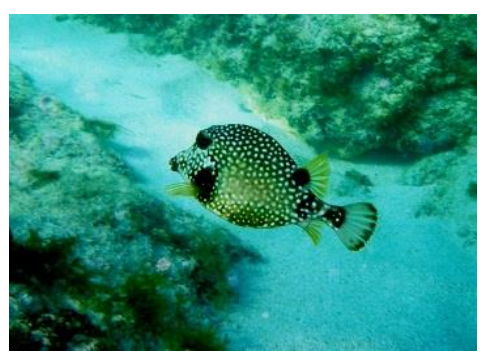
Smooth Trunkfish. Lactophrys triqueter. S-M. 2, 3, 5-7. Si, Rf.