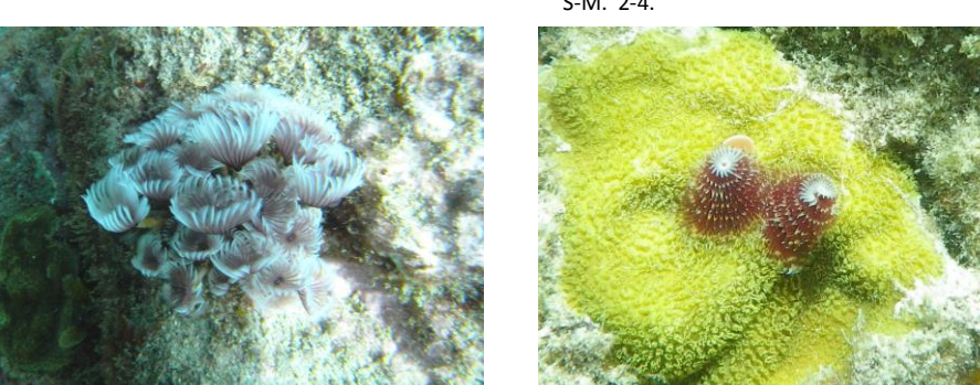
Christmas Tree Worm. Spirobranchus giganteus. VS, 2,3 & 5,6.